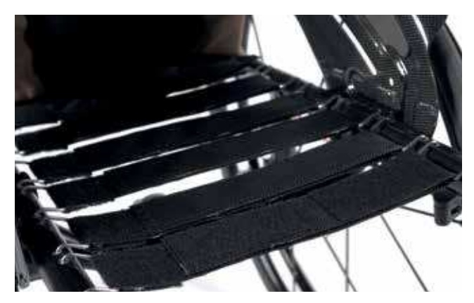
NEW clip style air flow seat upholstery Offers adjustable seating and increased rigidity for improved comfort and postural support.