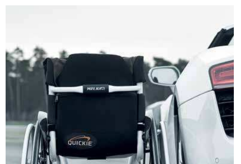
NEW Oval tube designs applied to the backrest and cross tube make the Helium even stronger, more efficient and more rigid.

Helium gives you maximum performance with a full range of ergonomic adjustments so you can fine-tune it to meet your personal requirements. You now have the ability to cover large distances and manoeuvre with minimum effort or fatigue.