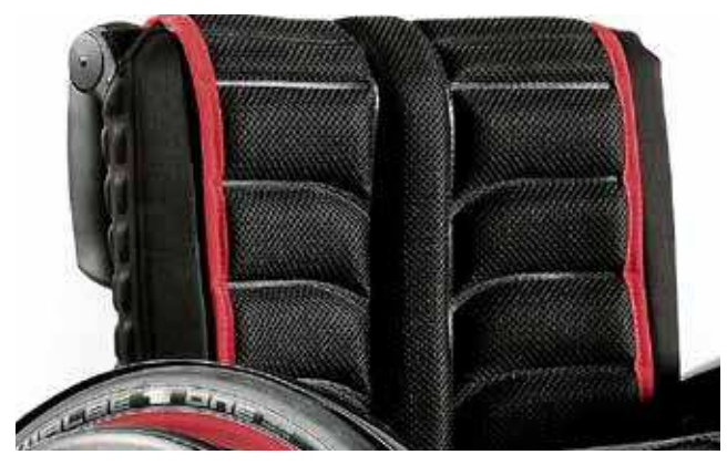
NEW and improved back upholsteries

Easily operated by the user, the new flip-up design ensures easier transfer of the chair across the body into a vehicle.