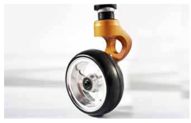
NEW one arm fork

Extra large wheel for extreme terrains with quick and simple slide-on and off fixation.