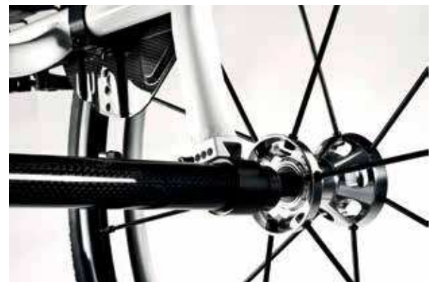
NEW carbon fibre axle tube Less weight, superb looks.