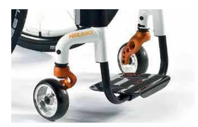
NEW carbon fibre footplate Lightweight and stylish footplate with angle and depth adjustment.