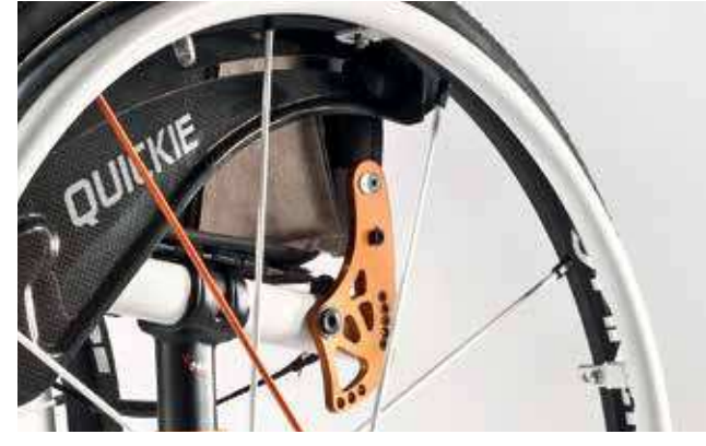
NEW backrest angle adjustment bracket

An improved design for a sleeker look, better comfort, a choice of new colourways and a new zipper for storage.