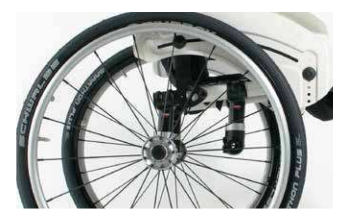
NEW handbike axle extension

Strong and modern design for a stylish and attractive look.