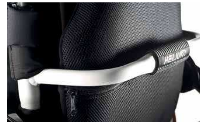
NEW oval shaped back tube with ergonomic hand grip. Increases rigidity by 15% and enables easier lifting and transfer. Available in two depths for improved positioning.

The latest technologies combined with innovative materials and stylish design - pure Helium.