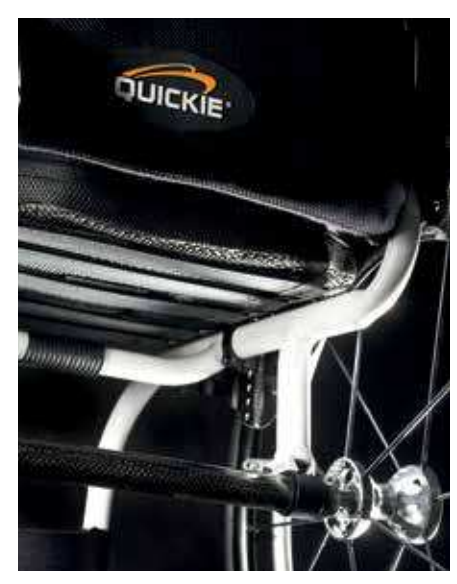
> Fully-welded frame Extreme performance for more demanding users