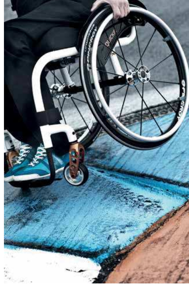
> Extremely strong and durable Wherever you want to go your new Helium is ready for you. Live without Limits!