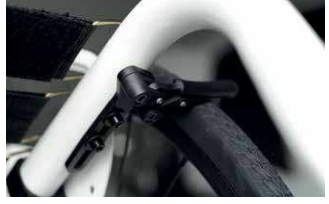
NEW lightweight compact wheel lock Improved design offers a lightweight, yet strong solution.