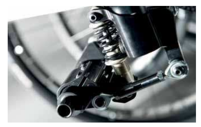
NEW suspension Sporty and lightweight suspension for a comfortable ride.