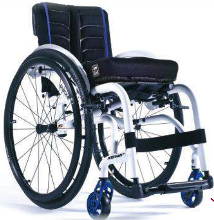
XENON² H (HYBRID) THE STRONGEST