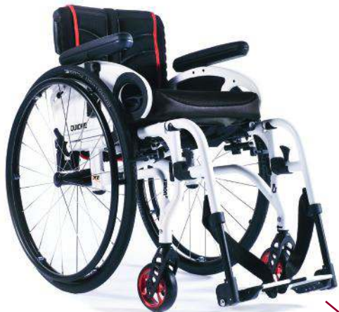
XENON² SA THE ALLROUNDER