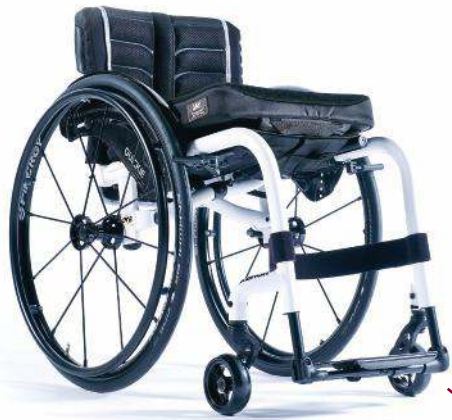
XENON² FF THE LIGHTEST