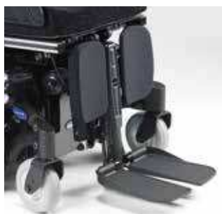
LNX powered centre mount

A maximum seat angle of 30° ensures comfort and safety as well as including a centre of gravity shift.