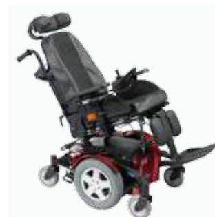
Powered fixed pivot tilt option

The new, simplified powered tilt option allows the seat angle to be positioned up to 20 degrees with no reduction in occupant weight.