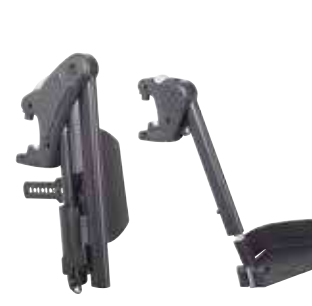
Side mounted legrest

A dedicated lower profile inner frame, along with 'tilt' and 'lifter and tilt' provide an optimised 'seat to floor' height.