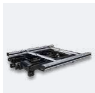
Modulite™ Telescopic inner frame

This option features a high pivot point for natural movement as well as a quick release mechanism for easy folding and transportation.