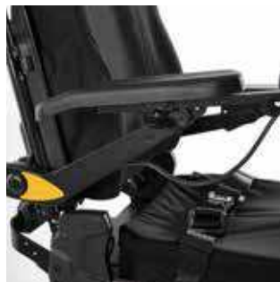
Flip Back Armrest