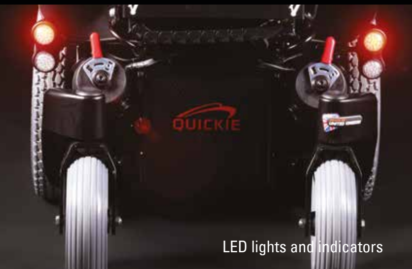
LED lights and indicators