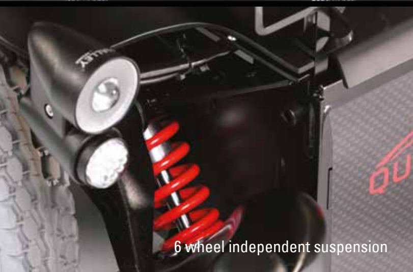
6 wheel independent suspension